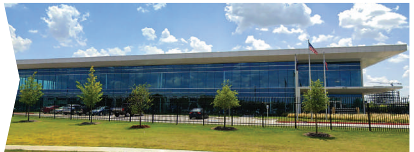
DataBank Data Center, located in Plano, TX, is a Tier III 144,000 sq. ft. facility with cloud, colocation, compliance, hybrid and connectivity services.

Our Drainable blade louvers are designed to prevent water penetration in non-wind-driven rain applications by collecting water in frame and blade gutters and channeling it into downspouts and away from airflow. Many are AMCA certified for water penetration and air performance, and our EFD-635 has an industry leading 60.7% free area.